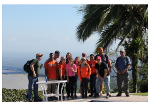
Maquenque Falls in Si-quirres

countries that you can ever visit. Blessed by beautiful beaches, volcanos, biodiversity, and