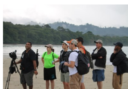
Cahuita National Park