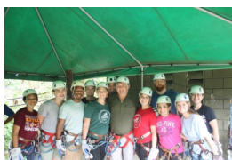
Zip-lining in Veragua Rainforest

Consult your Department and the OIRED office for SCHOLARSHIPS!