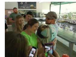
VT students at the Sloth sanctuary