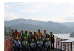
Reventazon Hydroelectric project