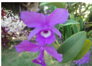
Guarianthe skinneri : Costa Rican national flower

With just over 51,000 km 2 in territory, Costa Rica is one of the most exotic